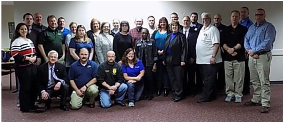
Inaugural Dispatcher/Call-Taker Training of CIT Trainers Participants