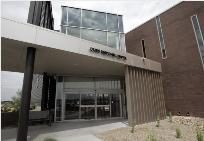
The Crisis Response Center Tucson, AZ