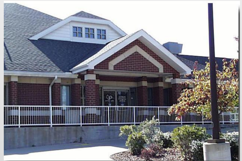
Portage Path Psychiatric Emergency Services Akron, OH