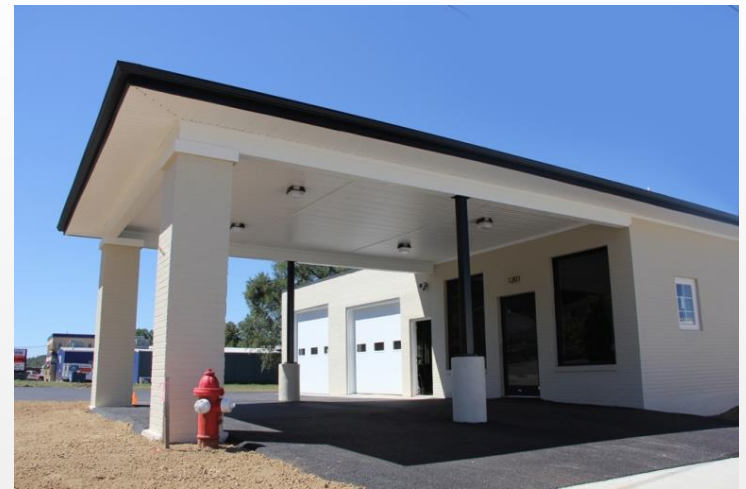
CIT Assessment Center Radford, VA