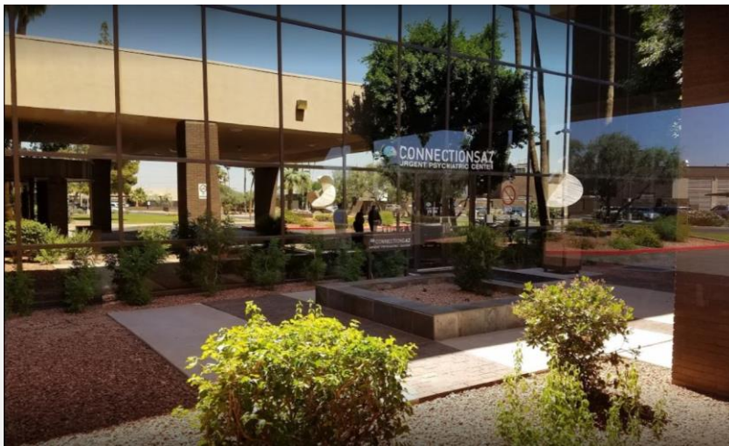
The Urgent Psychiatric Care Center Phoenix, AZ