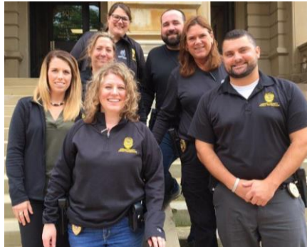
Lorain County Adult Probation CIT Outreach Team