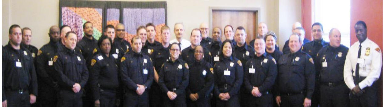
41 Cleveland Police Officers and a Dispatcher graduated from the ADAMHS Board CIT Training on February 13, 2015.

◆Our training is based on the nationally recognized Memphis Crisis Intervention Team model. ◆Involvement in the 40-hour CIT Training is voluntary and the Board offers the training free of charge.