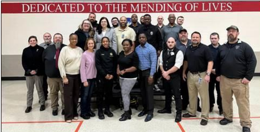
Coordinated by the Corrections Training Academy.

The Ohio Department of Rehabilitation and Correction (ODRC) continued