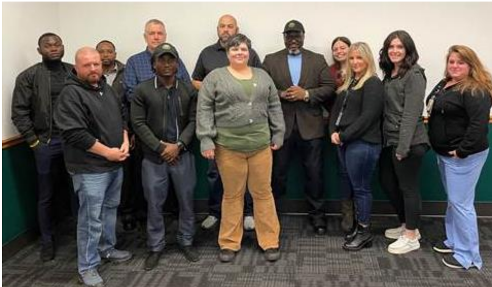
Coordinated by London Correctional Institution.