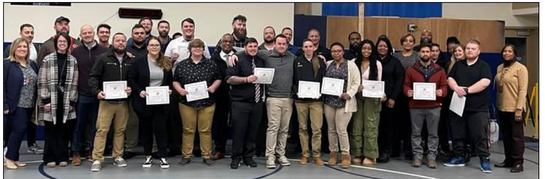
Coordinated by Lorain Correctional Institution.